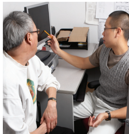
STOP HIV/AIDS aims to improve HIV testing, treatment, and linkage to health care services for individuals facing multiple barriers to care in Vancouver's inner city and Prince George.

• Northern Health is planning to hire a Blood Borne Pathogens Navigation Lead to coordinate integration of care and services in the community.